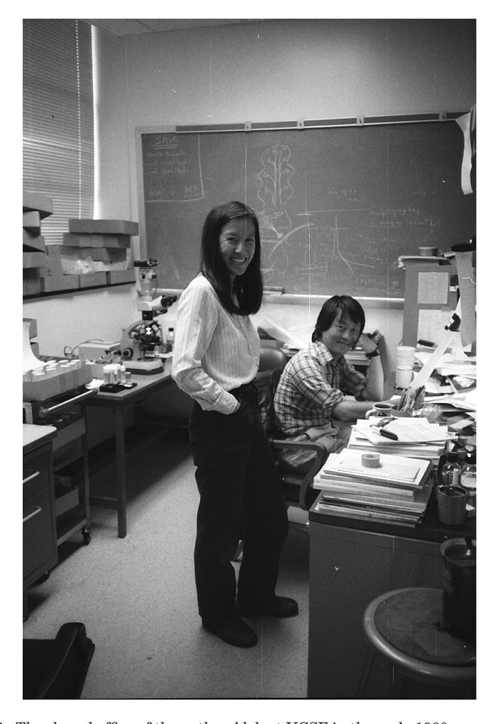
Fig. 4. The shared office of the authors' lab at UCSF in the early 1980s.

In late June 1979, we drove across the country during the height of the oil crisis, with our daughter a toddler not quite two years old, to start our lab at UCSF on July 1. It took us a couple of months to set up our little lab on the eighth floor of Health Sciences East (HSE) on the Parnassus campus (see Figure 4) and then we started doing experiments.