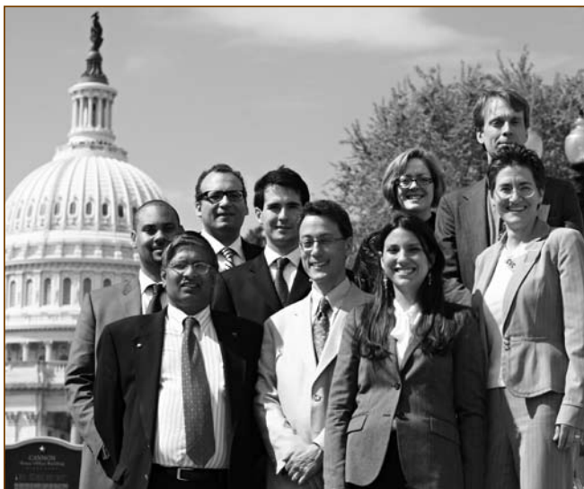
SfN Chapter members from Pennsylvania, Texas, and Massachusetts pose in front of the U.S. Capitol between Hill visits.

Participants spent the rest of the day visiting the offices of their Senators and Representatives, thanking legislators and staff for their commitment to science funding in the American Reinvestment and Recovery Act (ARRA). SfN