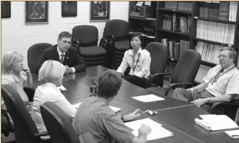
SfN New Mexico chapter members and Department of Neuroscience faculty meet with Rep. Martin Heinrich during a University of New Mexico lab tour to discuss the importance of sustained funding for basic science research.

SfN chapters play an increasingly important role in fostering SfN's growing advocacy effort. By working at the local level, chapters build greater understanding about the regional impact of science in communities around the globe and make the case for stronger funding. Chapters can advocate in many ways: educating legislators about science taking place in local communities, educating the general public on neuroscience, and speaking up in local newspapers for strong funding increases for scientific research.