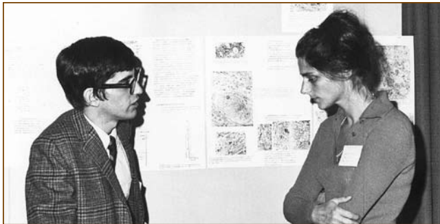
Attendees from SfN's first annual meeting in 1971 participate in a poster session.

One of the Society's primary goals, to promote the exchange of information among researchers, is achieved through the Society's annual meeting, the largest source of cutting-edge neuroscience research, and through The Journal of Neuroscience , the top journal in the field. In an effort to promote scientific excellence, the Society hosted its first annual meeting in 1971, bringing 1,396 attendees to Washington, DC. This number rapidly grew to 15,000 by 1991. Today, the Society's annual meeting draws more than 30,000 attendees, reaching a record attendance of 34,815 in 2005.