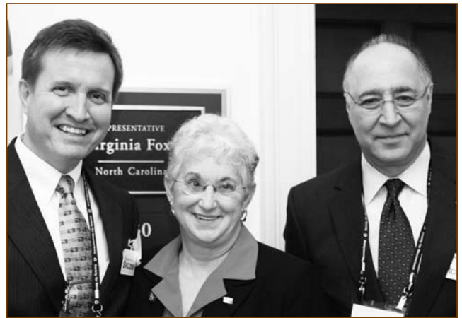
SfN North Carolina chapter members Dwane Godwin and David Friedman discussed the need for a robust and reliable investment in biomedical research with their legislator, Rep. Virginia Fox (R-NC).

members also urged at least 10 percent increase in science funding in FY2010 and FY2011 to sustain the scientific and economic momentum spurred by the stimulus. With Congress currently drafting FY2010 spending legislation, the SfN participants played an early role in advocating for robust research funding.