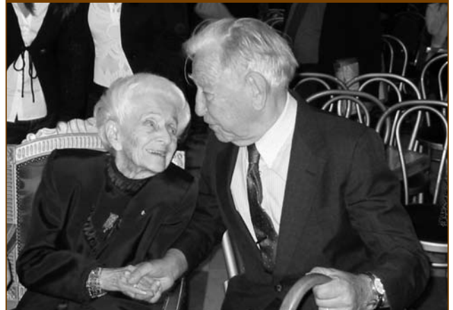
Rita Levi-Montalcini, the oldest living Nobel laureate, is pictured with co-laureate Stanley Cohen at her 100th birthday celebration in Rome.

Rita Levi-Montalcini, Italian neurophysiologist and oldest living Nobel laureate, celebrated her 100th birthday this April at a ceremony hosted by the European Brain Research Institute.