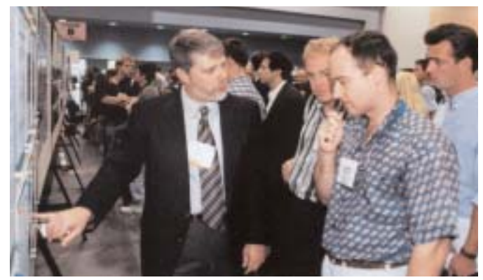
Attendees discuss poster at annual meeting.

your neighboring presenters on both sides, and not stand in front of their posters either.