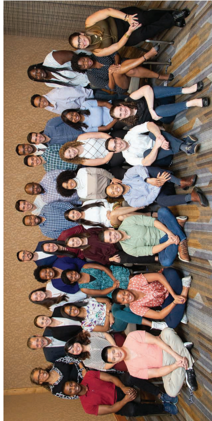
Fellows, Neuroscience 2018