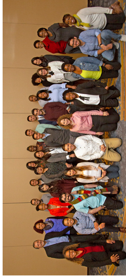
Fellows, Neuroscience 2017