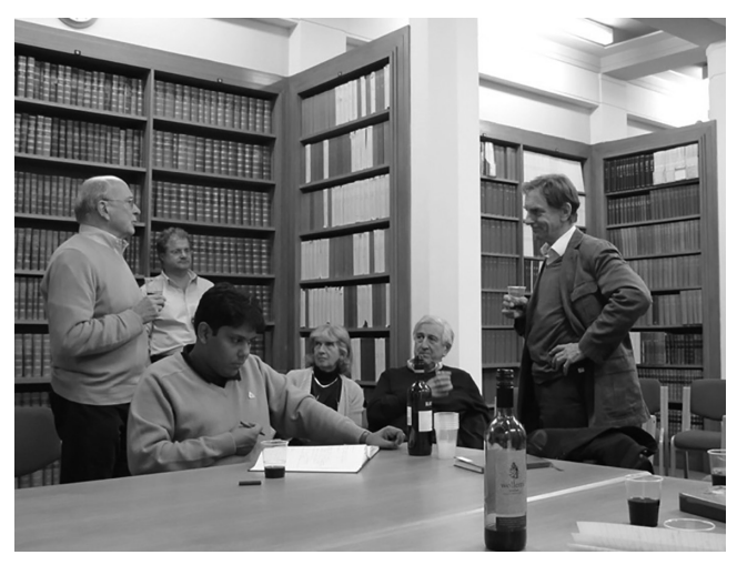
Figure 5. Debate at the Oxford Library in the United Kingdom.

To which I answered, "No, I will disappoint you. I cannot be president. I was not born in USA and have the birth certificate to prove it." I also cited Niles Bohr that, "Opposites are not contradictory but complementary."