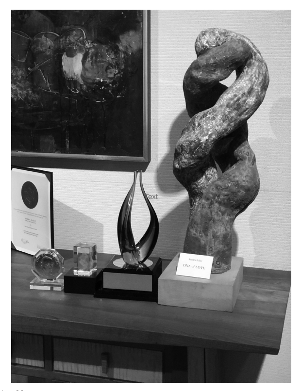
Figure 8. DNA of love.