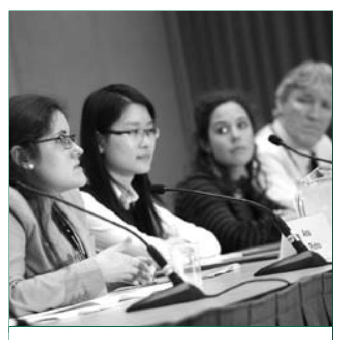
Press conference presenters at Neuroscience 2013 described recent findings revealing differences in the brains and behaviors of trained musicians.

When musicians and nonmusicians were exposed to only a single sound, both groups accurately reported they felt a single vibration on the finger. However, when a single vibration was accompanied by two or more tones, the nonmusicians described feeling multiple vibrations. Despite hearing multiple tones, the musicians continued to accurately report feeling only a single vibration.